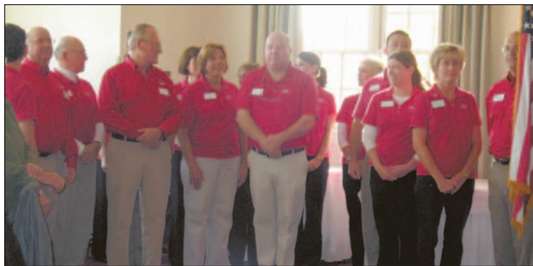
The Cape Cod Five Cent Savings Bank "Red Shirt Friday" Volunteers

FOOTNOTE: Many people confuse Memorial Day and Veterans Day. Memorial Day is a day for remembering and honoring military personnel who died in the service of their country, particularly those who died in battle or as a result of wounds sustained in battle. While those who died are also remembered, Veterans Day is the day set aside to thank and honor ALL those who served honorably in the military - in wartime or peacetime. In fact, Veterans Day is largely intended to thank LIVING veterans for their service, to acknowledge that their contributions to our national security are appreciated, and to underscore the fact that all those who served - not only those who died - have sacrificed and done their duty. (Source: US Department of Veterans Affairs website)