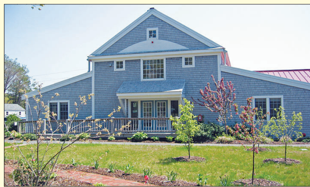
611 Gifford Street, Falmouth

We provided 40,464 bags of food to individuals and households in Falmouth, Mashpee, Joint Base Cape Cod, and those who worked in Falmouth but lived in another community in 2013.