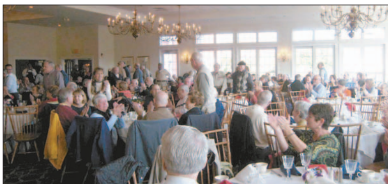
World War II veterans stand to be acknowledged