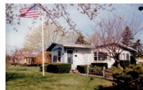
178 East Falmouth Hwy $459,000