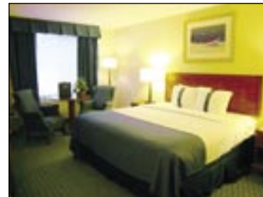
Newly redecorated spaces at the Holiday Inn Falmouth